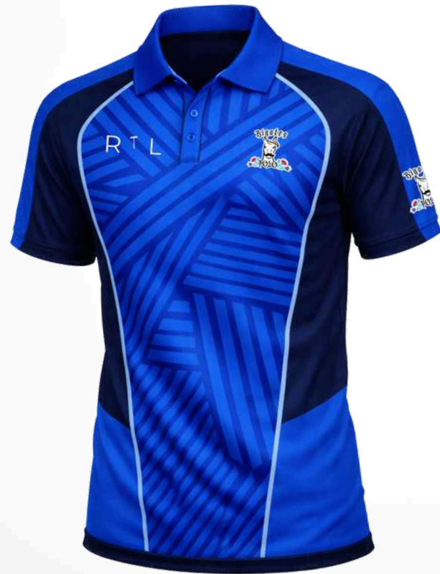
SUBLIMATED POLO SHIRT