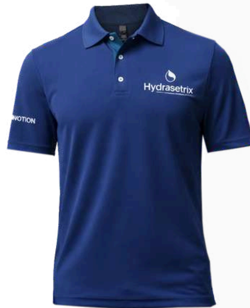
SCREEN-PRINTED POLO SHIRT