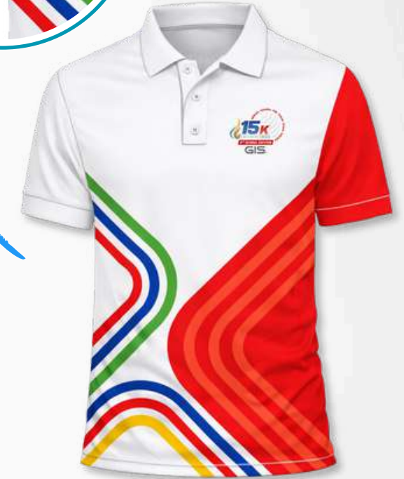
Custom Sublimated Polo